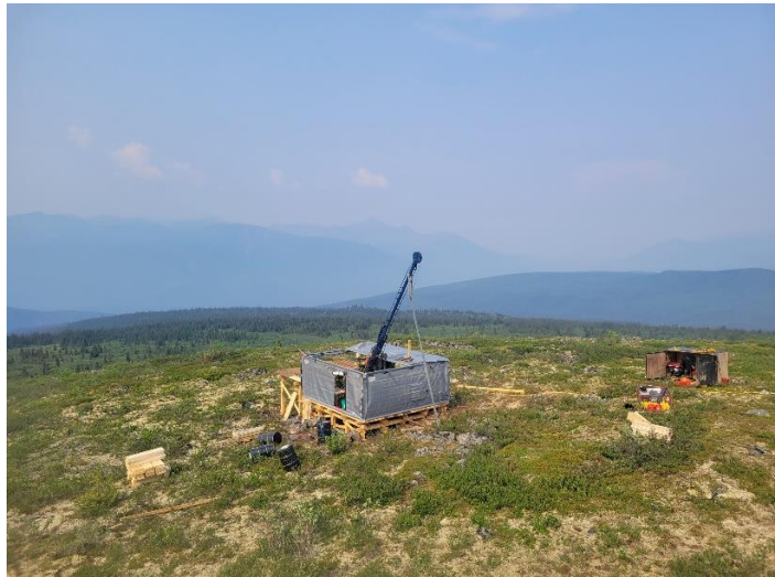
2022 Drilling at Fox Target at East Keno

Keno Hill is one of the world's highest-grade silver districts, with nearly 300 million ounces ("Moz") of silver in past production and current M&I resources 1,2 and featuring excellent existing infrastructure, including grid power, road access and nearby community services. In July 2022, Hecla announced the acquisition of Alexco Resource Corp, which holds the western portion of the district and mining and milling operations. Metallic Minerals' Keno Silver project is adjacent and contiguous, covering the east, and parts of the central and western Keno silver district and includes eight high-grade, shallow past-producing mines. Prior to the Company's consolidation of the land package, very little modern exploration had been completed in these parts of the district due to fragmented, private land ownership. Metallic Minerals has advanced three targets in the district from discovery to expansion drilling with several additional targets at drill-ready status along the known historically productive trends. In addition, recent exploration has defined and expanded 12 new priority multi-kilometer-scale early-stage targets for reconnaissance drilling in the under-explored parts of the district where highly elevated silver, lead and zinc in soils and high-grade rock samples have been identified.